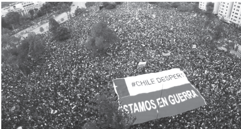
Mass demonstration in Chile

After this new revolutionary day of 10/25, the Conjunct General Staff of the Armed