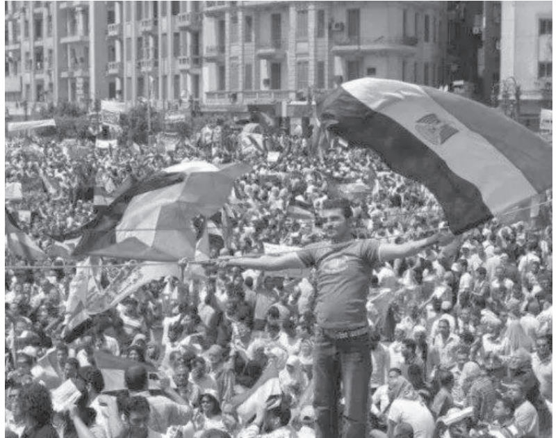
Once again, the masses have taken to the streets in Egypt

The New Left of Stalinists and renegades of Trotskyism's raising of the slogan of "constituent assembly" in Latin America at all times and places, is a true fallacy. It is