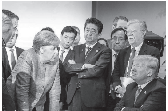
The Presidents of the imperialist powers in the G-7 Summit in mid 2018

From Frankfurt, Tokyo and the USA Federal Reserve (FED) credits flowed for their respective transnationals and