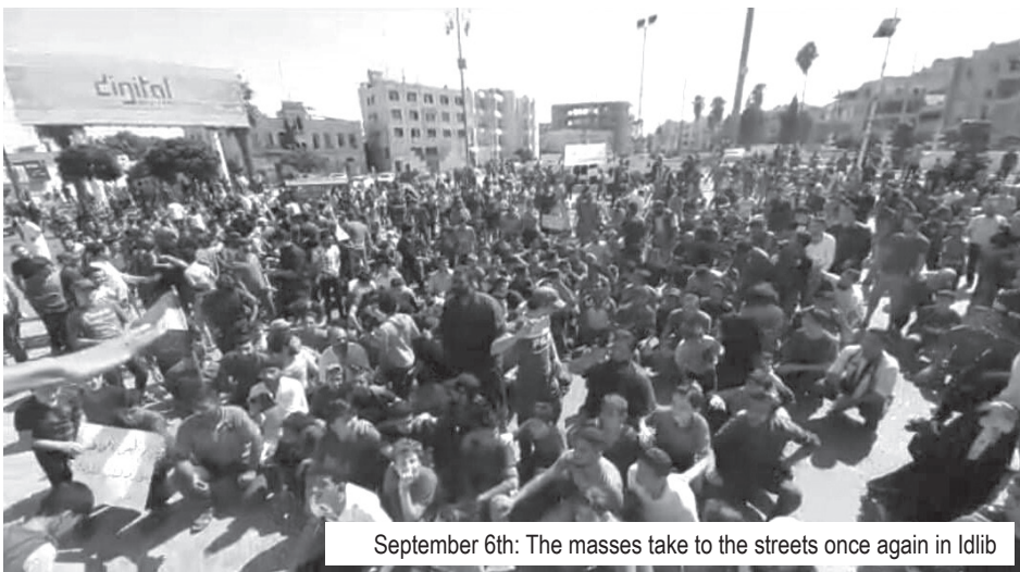
September 6th: The masses take to the streets once again in Idlib

But this also controls the reformist left that either openly supported al-Assad or raised the theory of the "two demons", stating that the FSA and HTS were the same as Bashar. A cruel lie. Al-Assad was the one who, with Putin, crushed the masses, while the officers of the Sunni bourgeoisie, such as those of the FSA or HTS, were the "Trojan Horses" which, with their siren songs, disarmed the masses from within the rebel zones, as we just said. Al-Assad did not manipulate or disorganize the resistance, but instead massacred it directly. The Sunni bourgeoisie was the one who played the perfidious role of riding over the revolution to give it out from within. Paraphrasing Trotsky in his fight