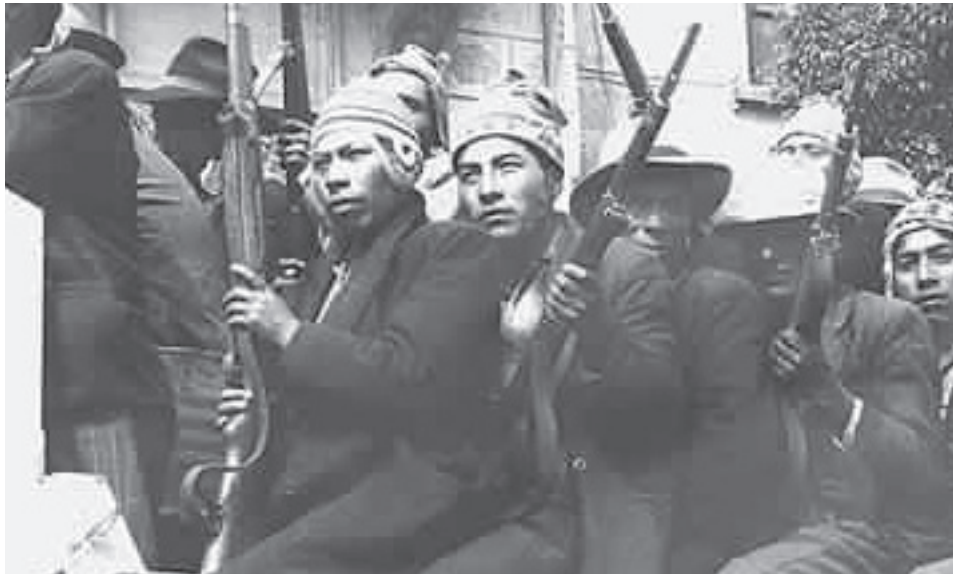
1952 workers militia

We publish here below the resolution voted on June 8 2005 by the COR-El Alto, the mineworkers and dozens of worker and poor peasants’ organizations that declares El Alto as the “headquarters of the Bolivian revolution”.