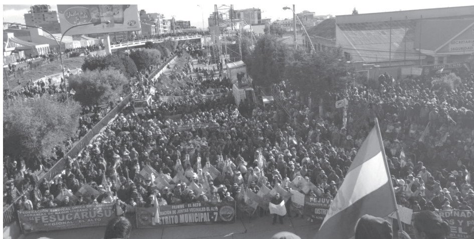
Demonstration in El Alto

The more the workers movement got divided, the more COB was lost as self-organization structure of