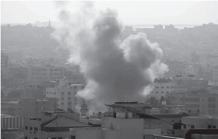
Zionist planes bomb Gaza