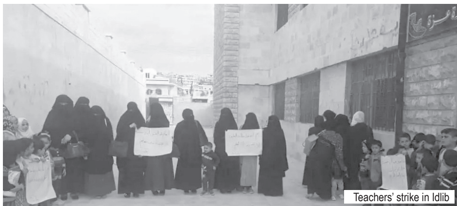
Teachers' strike in Idlib

looted, at the cost of the masses' hunger. But the resistance in Idlib does not surrender; there are the hungry workers and poor people who take the streets Fridays after Fridays against al-Assad and now also against HTS for bread and dignity, the same demands that pushed them to open the revolution in 2011 in huge mass mobilizations. They hold alive the flames of revolution in the last trenches, in the opposite of the bourgeois generals of the HTS and FSA who have only sell out one after the other the rebel towns and cities.