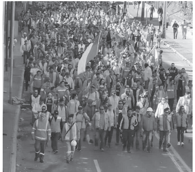
Dock workers demonstrating

delegates of the labor, student movement, poor peasants and all the masses in struggle!