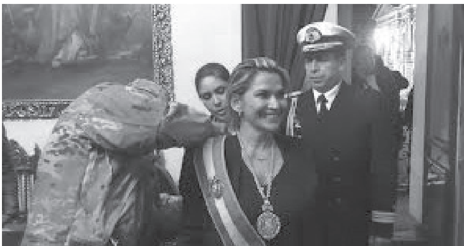
Jrsnir Añez takes office

Today, the bourgeoisie and imperialism tried to close the open crisis after the coup. This way, the fascist gangs of the Media Luna, the murderous police and the "milicos" surrounded Murillo Square in La Paz in order to allow the Legislative Assembly sessioning and perform a "constitutional succession". The session was a real circus and took place with some parliamentarians without even having quorum. Finally the presidency was given to Jeanine Añez, the vice president of the Senate, member of the Democratic Party of the Media Luna, recognized later by the Constitutional Court.