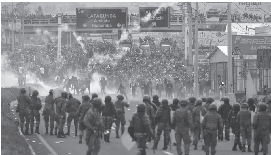
Barricade struggles against the murderous police in Ecuador

left the bourgeois mastery devices on their slaves totally dislocated. Huge revolutionary crises developed in the heights, as in Ecuador , where true dual-power organizations emerged, such as the FUT and CONAIE, whose leaderships saved the bourgeoisie from its collapse when Lenin Moreno fled from Quito to Guayaquil before the semi-insurrection of masses. These leaderships brought him back to Quito and restored him to power, after the army base refused to repress the insurrectioned masses. It is the collaborationist leadership of CONAIE and the FUT that supports the government of Lenin Moreno today. The mass insurrection set up dual-power organiza-