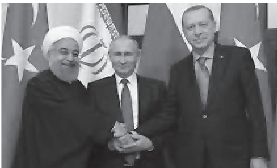
The heads of Iran, Russia and Turkey

Today, imperialism is using Syria as a lesson for the workers of the world, to show them what will happen to them if they fight against adjustment plans, food price increases, labor flexibility, etc. Upon the defeat of Syria, imperialism takes a breath in its offensive against the masses and oppressed peoples of the world. But nothing is still defined worldwide. New fighting opens in different sectors of the planet's working class, as in Hong Kong. In them there are the allies of the Syrian masses, as in all the exploited who refuse to leave the streets in the Middle East! At the international level, an effective solidarity coordination committee with the Syrian revolution must be set up before it is too late. May workers' organizations win the streets in support of the Syrian masses in Idlib against the al-Assad massacre! We have to go to all the embassies of the dog Bashar and the butcher Putin!