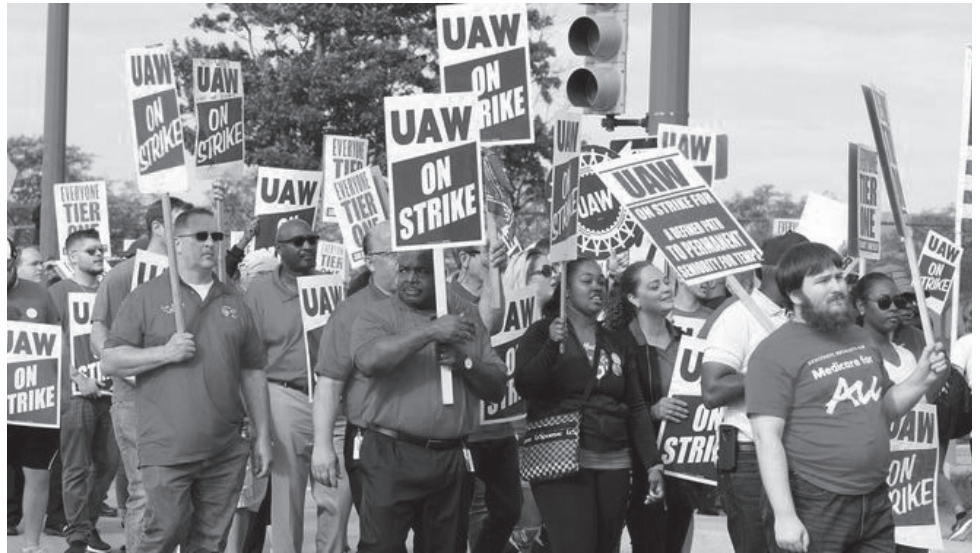
GM workers on strike in the USA

Though, with revolutionary uprisings, the world working class states that they have not surrendered. The Middle East is on fire, Latin America is entering a pre-revolutionary