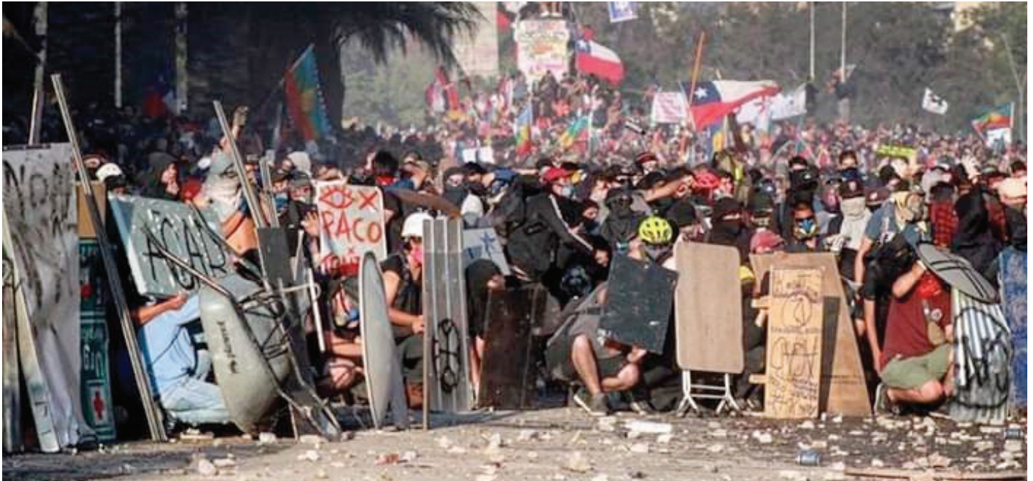
Mass uprising in downtown Santiago (capital city of Chile)

A new revolutionary day of struggle of the masses took place in the entire country since early in the morning. Despite the wishes of Piñera and the entire bourgeoisie that aimed to exhaust the struggle that had been going on for more than 3 weeks, today a great revolutionary general strike was developed with strikes, mass demonstrations, fighting in barricades, clashes with the murderous police, blockades of highways and streets, attack on banks, tolls, luxurious hotels, churches, the Argentinean Embassy, an office of the Pinochetist UDI in Talcahuano among other bourgeois institutions.