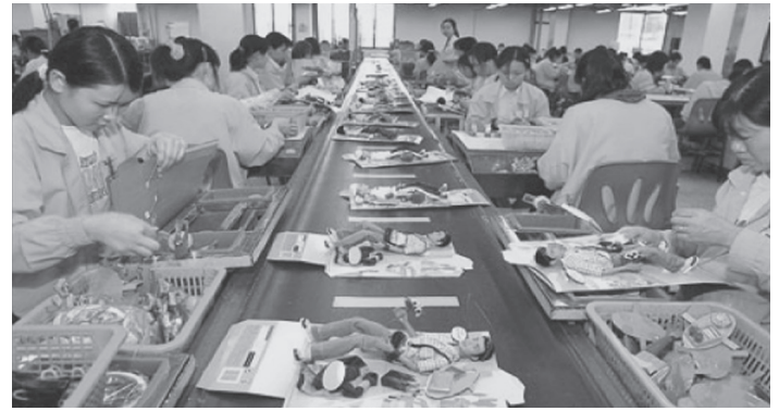
Workers super-exploited in a Chinese sweatshop