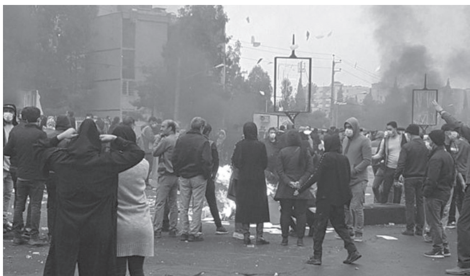
Mass uprising in Iran

The spark that ignited the fire—with revolutionary struggles all over the country—was the fuel price hike, where it used to be almost free since it is the second oil exporter. Now, the oil is refined in Germany and its derivatives are re-sold to Iran at high prices and the Ayatollahs' regime tried to make