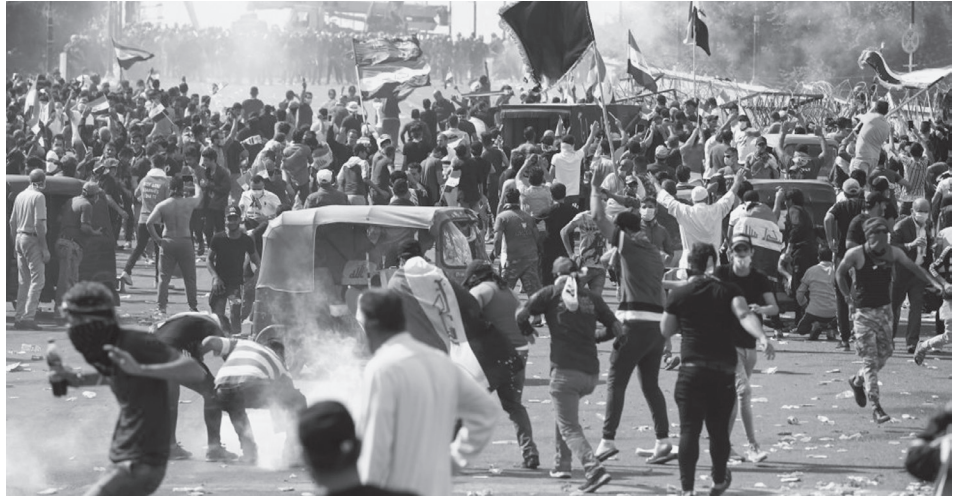
Revolutionary uprising in Iraq

“We are not Shiites, Sunnis or Kurds; we are the rebel Iraqi people”