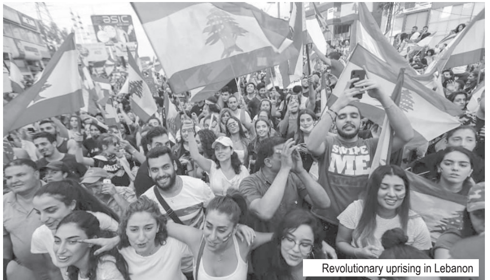
Revolutionary uprising in Lebanon

We are facing a generalized uprising of the Sunni masses as in Tripoli, the Shiites of the south, Christians