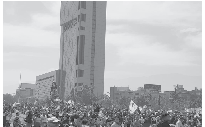
The masses take over Plaza Italia, in downtown Santiago

Self-defence committees to confront the murderous police and the Pinochetist military!