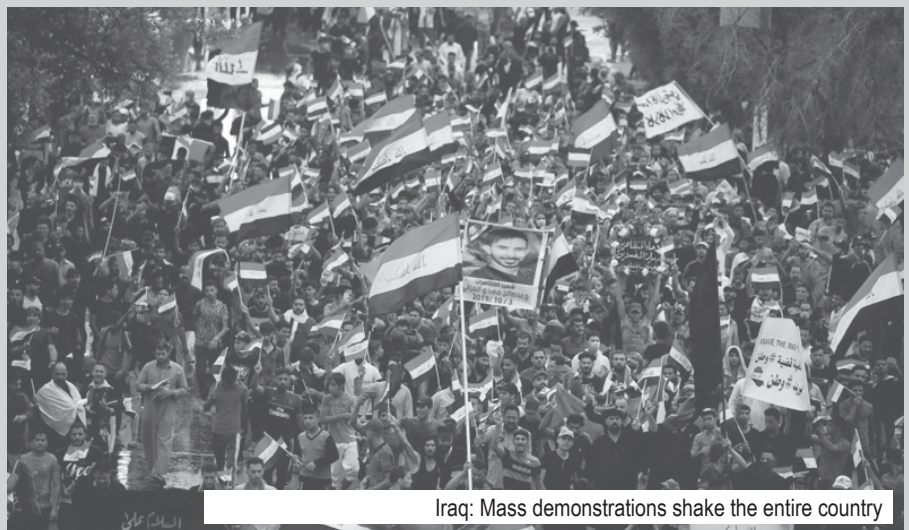
Iraq: Mass demonstrations shake the entire country

Iraq will end up being the tomb of Yankee imperialism and the Sunni, Shiite and Kurdish lackey bourgeoisie, who organized a government under their protectorate to assassinate and starve the people.