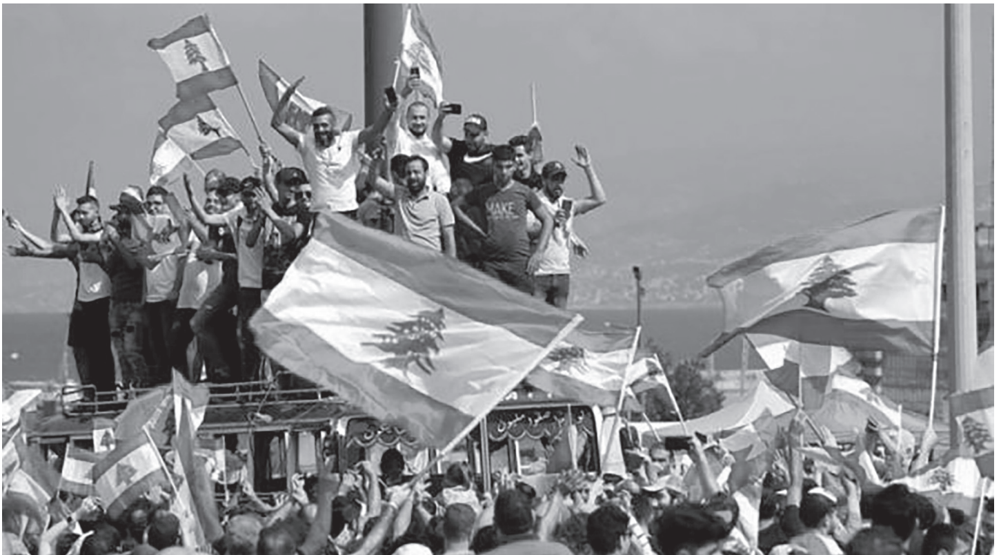
Revolutionary uprising in Lebanon

I n the midst of the marasmus of the world economic crisis and the disputes between the imperialist powers, they have launched both a fierce offensive against the working class and the looting of the oppressed peoples. Great capital has centralized its attack on the exploited worldwide. Hyper-taxes, labor flexibility, skyrocketing cost of living, devaluation of the currencies cover most of the planet.