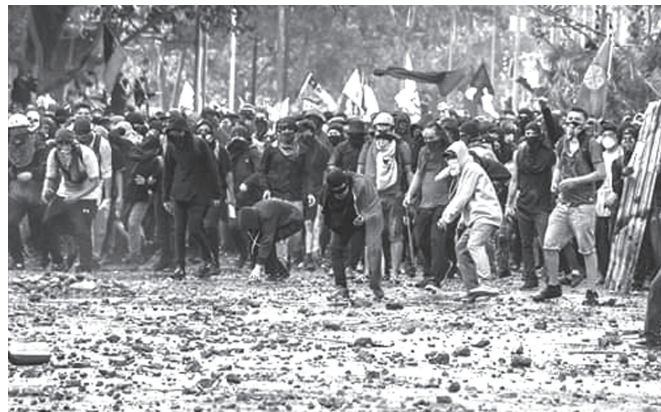
November 4th 2019: Fighting in the centre of Santiago

This is our revolution and taking it to victory we will avenge our grandparents and parents who were massacred in ‘73 by imperialism and its agents. For a revolutionary provisional government of