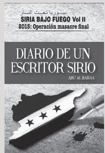
Syria Under Fire volume 2: Diary of a Syrian writer

Available for every worker and young fighter of Syria and every country in the Middle East