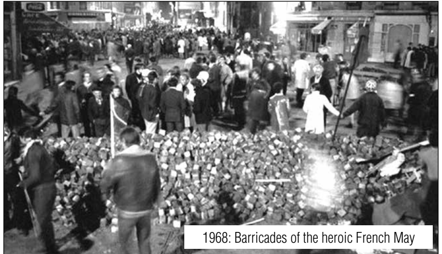
1968: Barricades of the heroic French May

What about the increase in the fuel prices? A gross hoax... The increase is postponed. Undoubtedly, with the masses off the streets, with the union bureaucracy regaining control of the workers movement, with the bosses enslaving the workers in the companies, with the state flogging the immigrants, the unemployed and the youth, that is to say, once the situation is stabilized, the hike in fees will return again. On what day of 2019 will this be? The one in which the masses are once again controlled by their leaderships and evicted from the streets.