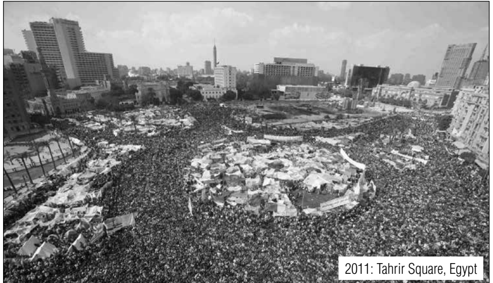
2011: Tahrir Square, Egypt

What travels through France is the ghost of the revolution and of the French May, and that begins to travel all over Europe.