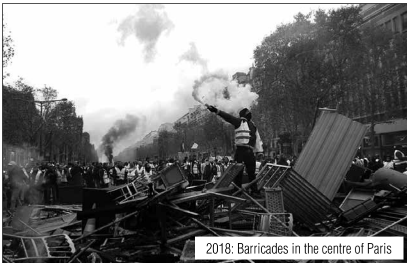
2018: Barricades in the centre of Paris

In that meeting they began to devise a big scam and a deception against the workers. First, they mounted a scene to announce that "concessions were given" to the rioting workers and people, making them believe that such concessions as the 100 euros "wage increase" and the suspension of the price increase of fuel, were a result of the demands of the union feder-