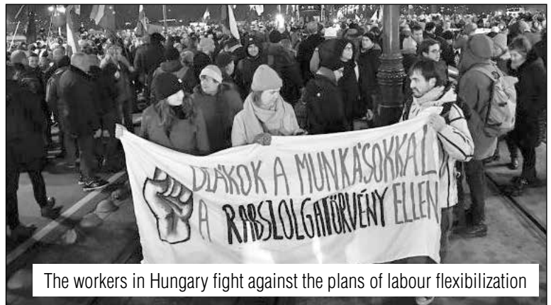
The workers in Hungary fight against the plans of labour flexibilization

At the G-20 Summit they agreed a 90-day truce to close their gaps, while the Democratic Party of the Yankee imperialists tries to channel the brawling fight of the black workers, the martyred immigrants in the productive process of the USA, of the women and the rebellious youth, by including candidates from those sectors to better de-