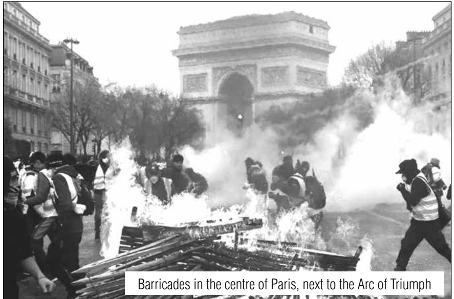
Barricades in the centre of Paris, next to the Arc of Triumph

Day by day the revolutionary days were raising and demonstrating in higher actions, the level of consciousness of the masses. In the fight, they are learning. All the sectors that enter the combat carry their claim. Although