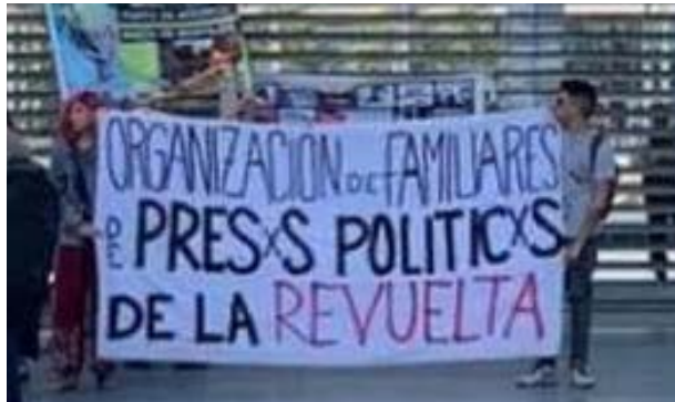
The banner reads, "Organization of Relatives of the Political Prisoners from the Revolt"