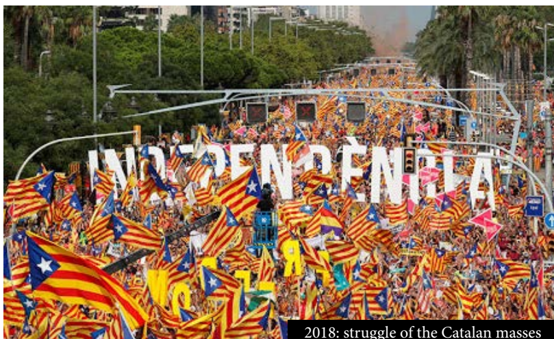
2018: struggle of the Catalan masses

It is a lie that there are no conditions to coordinate and extend Nissan's workers' fight. There is not a single sector of the working class or youth of the oppressed nations that does not have accounts to settle with this infamous regime of the monarchy and the politicians representing the capitalists and bankers. There are plenty of conditions to prepare and organize a great fight, as in the USA, as in France, as in Lebanon, as in Iraq, as in Chile and as yesterday in Catalonia.