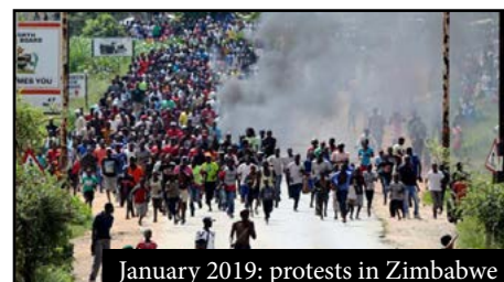
January 2019: protests in Zimbabwe

Black Vests! The same class, the same fight over borders, races, languages and cultures! For internationalist unity and solidarity among the oppressed! The rebellion of the slaves is not a crime, it is justice!