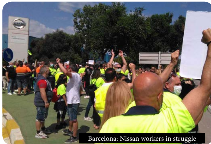
Barcelona: Nissan workers in struggle

Comrades, not only the exploited enter the fight in the central countries, but also in the Middle East the processes of rebellion and mass revolution are still open. The fall in the price of oil is causing enormous economic catastrophes and famines in all the countries of the region. This situation has sparked new revolutionary eruptions, as in Lebanon, where the currency has been brutally devalued (from 1,400 Lebanese pounds to the dollar to 7,000 in a few days). This has made food inaccessible and the masses have taken to the streets and burned the Central Bank.