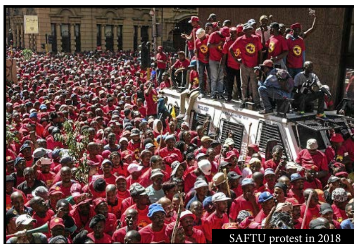
SAFTU protest in 2018

Nationwide, the net worth of Black Americans is staggeringly low compared to white Americans. The median wealth for a white family was $171,000 in 2016, according to the Federal Reserve Board (the U.S. central bank). That number was $17,600 and $20,700 for Black and Latino or Hispanic