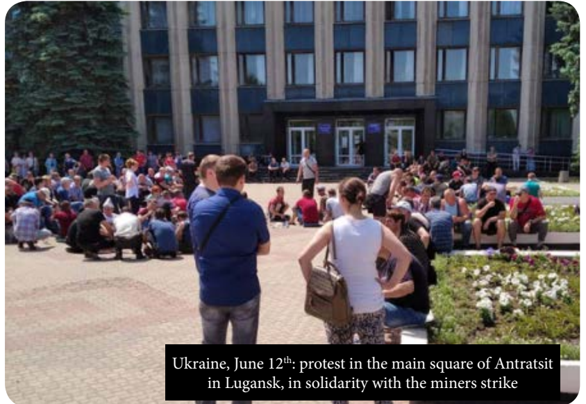
Ukraine, June 12 th : protest in the main square of Antratsit in Lugansk, in solidarity with the miners strike