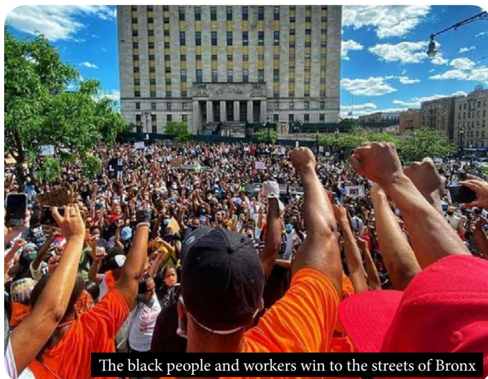
The black people and workers win to the streets of Bronx

Today the working class has left-beaten at the international level all the treacherous leaders of Stalinists and rene-