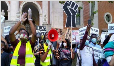
Madrid , protest at the US Embassy gates on June 7 th