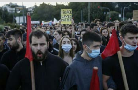
Greece , protest at the gates of the US Embassy in Athens on June 3 rd