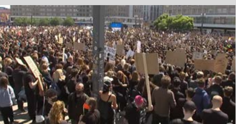
Germany , protest in Berlin on June 6 th