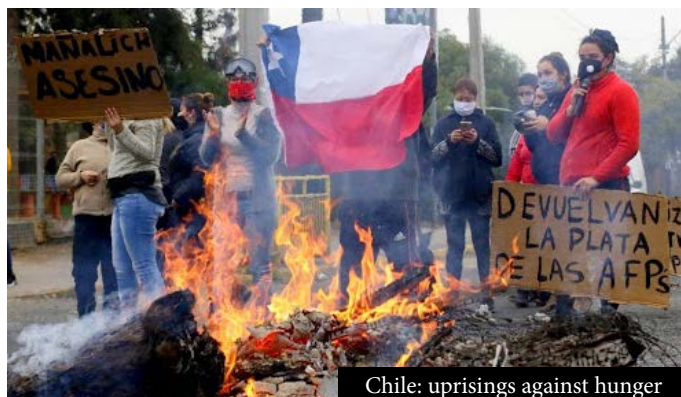
Chile: uprisings against hunger

populations and on the streets of Ecuador and Colombia.