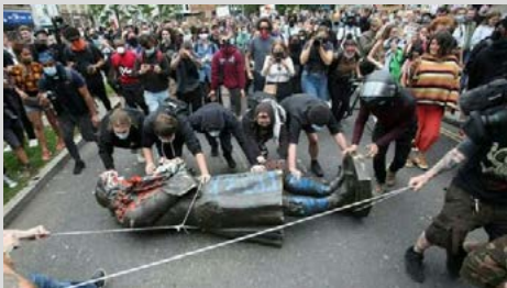
England , the statue of slave-owner Edward Colston in Bristol