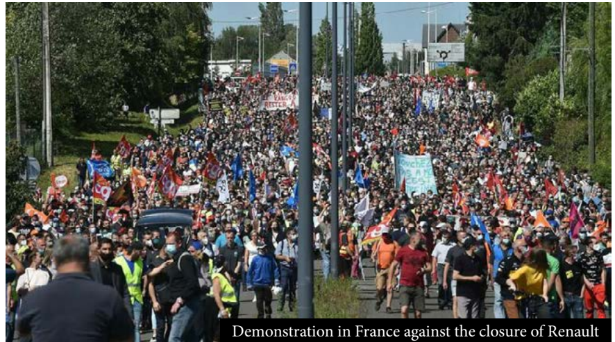
Demonstration in France against the closure of Renault

In the face of this huge Nissan attack on the Barcelona plants, the union bureaucracies of CCOO and UGT