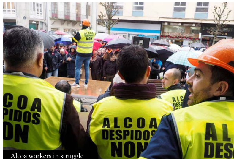
Alcoa workers in struggle

Out with the union bureaucracy from CCOO and UGT!