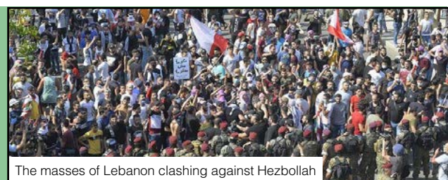
The masses of Lebanon clashing against Hezbollah

SYRIA: with the infamous regime of Al Assad and Putin, under the US command, the plundering increases, the currency is devaluated and... a generalized starvation takes the people out onto the streets again Page 23