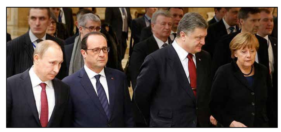
European rulers and Putin in the Minsk agreements

At the end of 2013, Ukraine went into default, drowned by the fraudulent debt with the IMF. The then president of Ukraine, Yanukovych, was negotiating with the EU so that the latter lend him the millions of dollars for the repayment of the external debt. Putin offered to be the guarantor of the repayment to imperialism, with 15 billion dollars. A huge gap opened up between the different Ukrainian bourgeois gangs, the