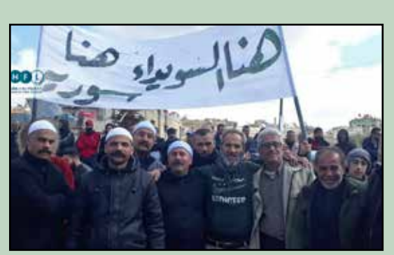
Uprising in Swayda

Only the working class fighting for its demands can re-unify Syria, which was partitioned from the Geneva conference