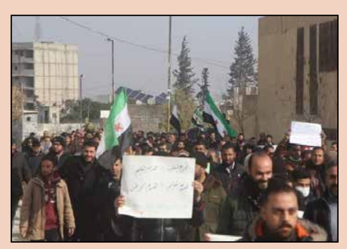
Demonstrations in Idlib countryside against dire conditions

Free all the revolutionaries imprisoned in Jolani's jails! Out with all businessmen of HTS and the National Army!