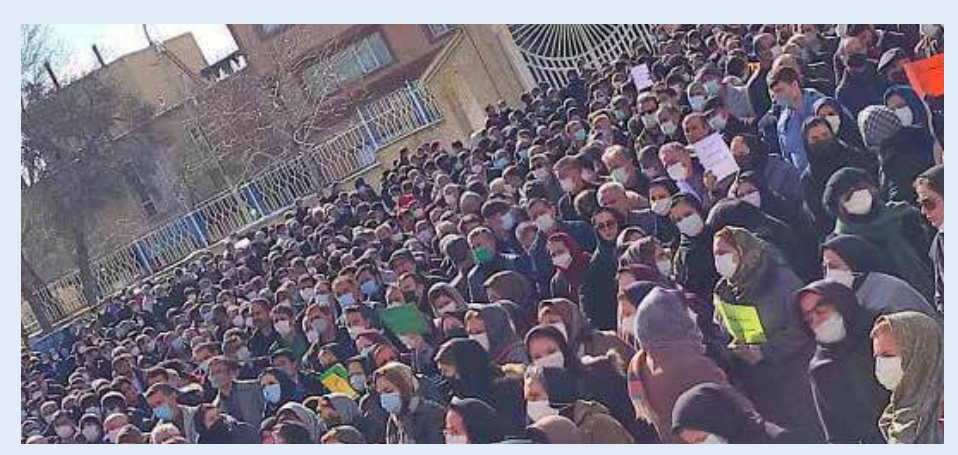
Iranian teachers on strike

From Docentes por la auto-organización de las Bases (Teachers for the self-organization of the rank and file) of Argentina, we are following the huge teachers struggle that has been unleashed in Iran, mainly for decent wages and the freedom of all the teachers imprisoned for fighting. We are touched and we are for the victory of the huge strike that started in over 100 cities in Iran, which is part of a wave of struggles of oil workers, sugar cane workers, construction workers, bus drivers, municipal workers, retirees, and other sectors that have been fighting against the Ayatollah regime.