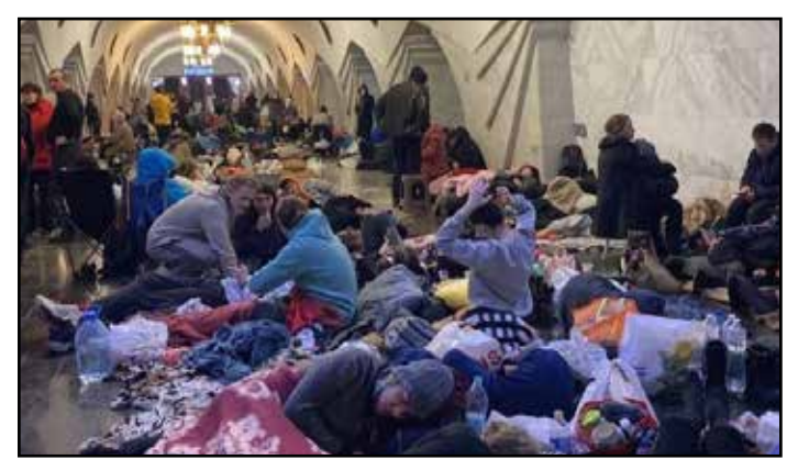
Ukrainian people taking shelter in Metro

Putin saw this imperialist offensive by NATO and at the same time these inter-imperialist contradictions. Supported by broad layers of the middle classes of the "great" Russia and in a ferocious repression and crushing of the masses (which for now leaves him the hands free to fight at international level), Putin moved 150,000 men to the border, invaded Kazakhstan to crush the revolted workers, occupied Belarus and prepared his counterattack in the Ukraine. No class or class sector gives up without a fight, let alone if it has 13,000 nuclear warheads behind it and one of the most powerful armies in the world, inherited from the former USSR. And this is so, despite the fact that the "great" Russia depends on the exports of its wheat, gas, oil and minerals to trade as a major supplier of raw materials and commodities in the entire world market, particularly Europe. Likewise, Russia also decisively needs the world economy, controlled by