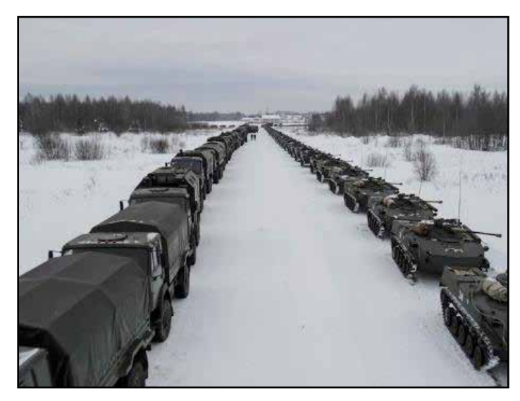
Russian convoy entering Kazakhstan

The government was in crisis, and the masses went for everything. An embryo of workers 'militia was beginning to emerge and the danger for the bourgeoisie of the emergence of a dual armed power of the workers' and soldiers' Soviets, that is to say that the workers' republic of Kazakhstan would return, expropriating imperialism. Seeing armed workers speaking the language of revolution in a former Soviet republic freezzes the blood of imperialism and the world bourgeoisie. The reason is the bourgeoisie knows very well what it is about, it still cries that there the workers rolled the heads of the tsar