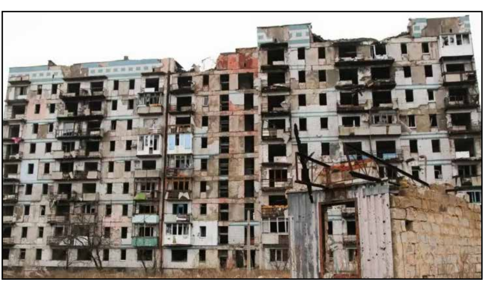
Donbass Buildings destroyed

If a starving citizen from Donbass asks the Kiev government for help, he/she will find that they are offered 26 euros.