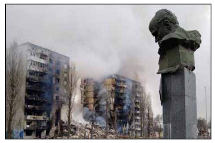
Ukraine bombed by Putin

The US did this in the way that the imperialist powers dispute the spheres of influence: putting the weapons, the bayonets, NATO