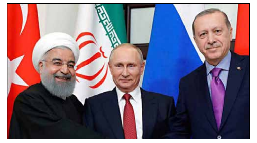
Putin, Erdogan and Rouhani in Astana conference

In northern Aleppo countryside, the National Army controls. The National Army is a union of all factions of the FSA who didn't return to al-Assad's army after they handed over the rebel cities. In here, the FSA is