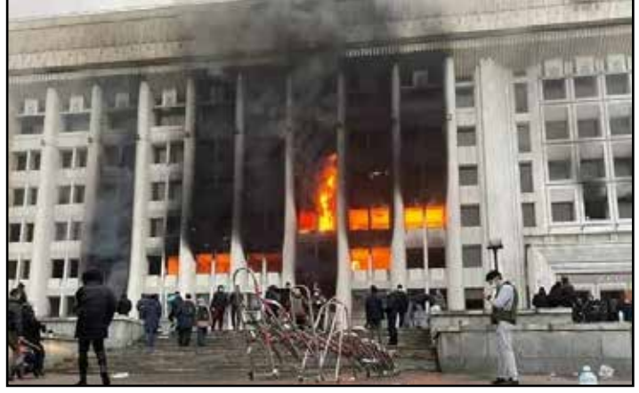
Almaty, Kazakhstan, the masses set on fire the government buildings

Kazakhstan is a country rich in resources. It has 40% of the world's