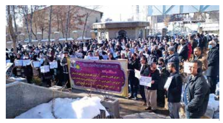
Iranian teachers on strike

The Iranian working class is already fighting in the streets, with its