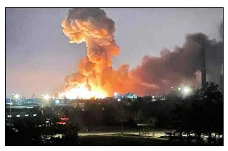
Russian bombing of Kiev

Independent Ukraine was not a misunderstanding of Lenin and the Bolshevik revolution of 1917, quite the contrary. Because only under the revolutionary government of the Soviets in the USSR, the oppressed peoples of Eurasia and Eastern Europe were able to achieve their self-determination and even the foundation of their nations. This is so because the working class is the only class that does not live from the work of others, but from their own work. It is not a class that oppresses, contrariwise, it is an exploited class. Hence, the war cry of the Bolsheviks of 1917 must reach the workers of to-