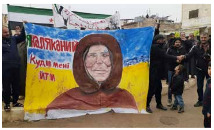
Demonstration in Binish in support of Ukraine against the invasion of Putin

Syria was one of the focuses where imperialism concentrated its forces to cut the chain of revolutions that shook