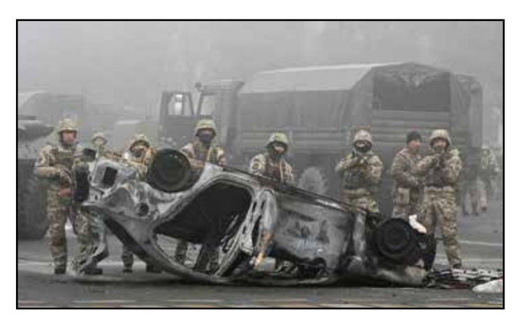
Russian army crushing the uprising in Kazakhstan

Putin's troops are not on the border with Ukraine to wage war against NATO... they are there to shoot every last bullet, as the pro-