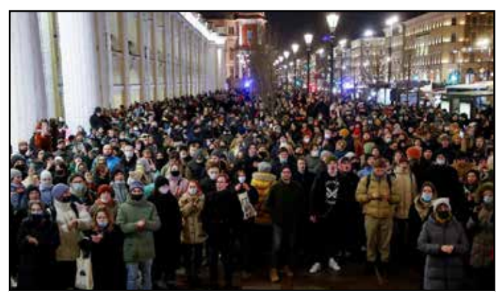
Moscow: demonstration against the war

The Zelensky government of Ukraine screams from the rooftops that they have left him alone. What did he believe? That NATO troops are national liberation troops? how cynical! NATO troops are just as murderous and oppressive as Putin's. They are the ones who massacred a million Iraqis. The ones that invaded Vietnam and